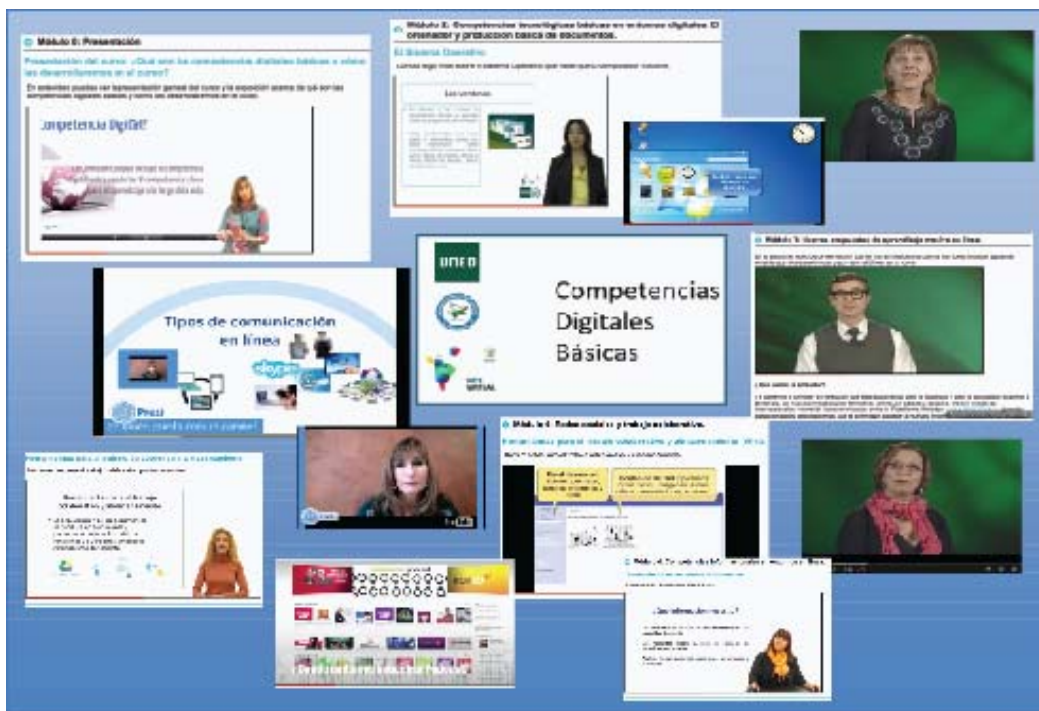
Figure 2. Types of multimedia contents on Ibervirtual UNED COMA: Basic Digital Competences

Each module offers a wide diversity of video contents as well as complementary documents and hyperlinks. Some of them respond to preliminary explanations and others to video tutorials, recorded both in studio and by teachers on their own: TV, polymedia and screencast recordings, all of them open in YouTube (Figure 2).