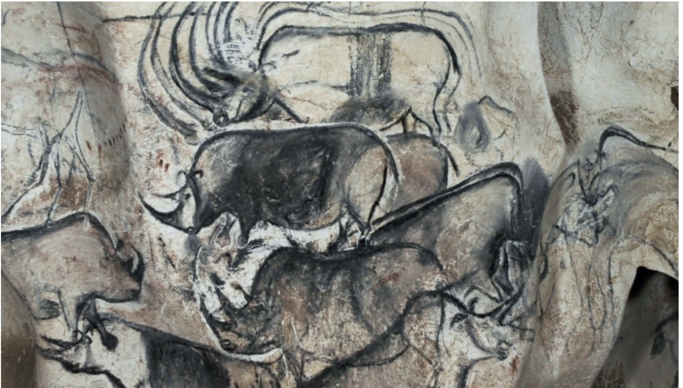
FIGURE 4: DETAIL OF LAYERED IMAGES OF RUNNING ANIMALS, VISUALIZING MOVEMENT BY OVERLAYING IMAGES IN «DIFFERENCE.»

Jennifer Barker's proposal for this type of analysis via a tactile engagement with moving-images– not just of the cave art, but also of the movie images themselves. 28