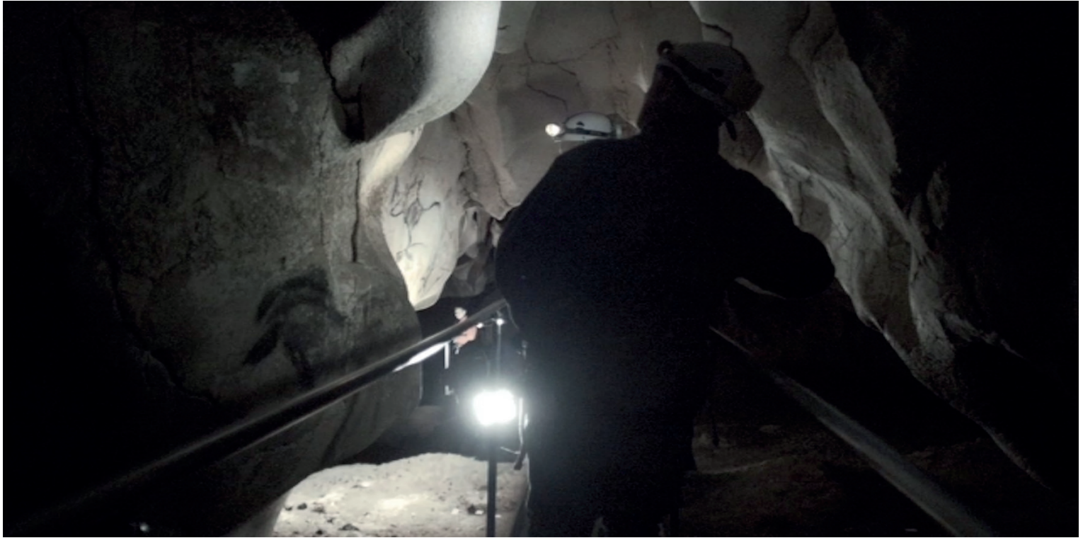
FIGURE 2: HIGHLY INTIMATE SHOT OF THE CAMERA THAT FOLLOWS THE EXPLORERS ON THE NARROW PATHWAYS, BRINGING THE CAMERA CLOSE, YET AT A CAREFUL DISTANCE, TO THE CONTOURS AND CURVES OF THE PAINTED ROCK SURFACE.

cinema I have pointed out how the aesthetic of the sublime in landscape depiction sets up a dual ambition of submission in awe and wonder, and a resulting desire for visual mastery. 21 This ambivalence results in tensions so effectively organized in, for example, high-paced, 3D action movies, very similar in effect to the so-called phantom rides of early cinema. These are point-of-view shots of passing landscape taken from a moving vehicle such as a train or car. As such, they boast about the technological possibilities of travel and the moving image together. What the use of 3D technology as exploratory rather than immersive counters is this rather long tradition of visual challenge and its overcoming through domination –called the sublime. 22