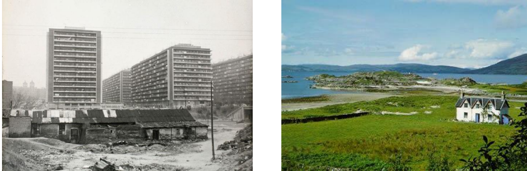
Fig. 5. Barrio de la Concepción in the 1960s vs Camusfeàrna (“El barrio de la Concepción”; “What’s There?”)

Camusfeàrna and the Highland wilderness may have seemed to him, stuck in a stifling narrowness of hardship, repression and fear.