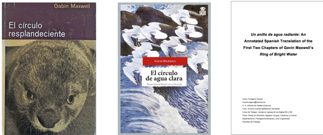
Fig. 2. The covers of the three versions analysed

used by people to achieve all kinds of goals” [82, 85]) every text –which they propose as the basic unit of language (87)– needs to meet all seven parameters in order to be communicative (Chruszczewski 1).