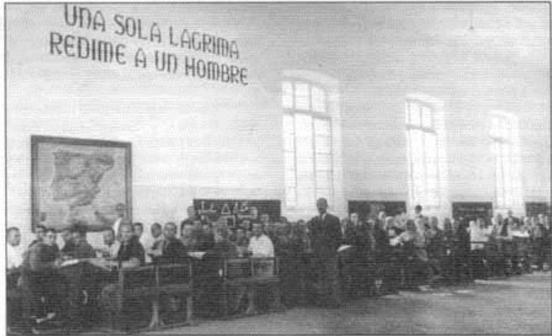
GRUPO DE PRESOS EN LA "RESERVA" DE LA CÁRCEL DE BURGOS