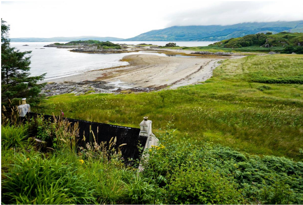
Fig. 1. Sandaig Bay in 2013 (Turégano)

Turégano was unaware of De la Escalera’s translation until well into his own project, 20 then procuring a secondhand copy. No sooner had he started reading than he dismissed it as “not worth even to consult its choice” in cases of doubt (Turégano 5), on account of its “overall carelessness” (ibid.). At that time, Turégano had not learned yet about De la Escalera’s fateful life, and neither had he about his attested refinement as a writer, and for this reason his criticism on this particular work was quite severe.